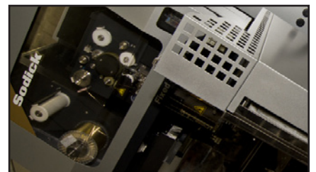
wire & spark erosion