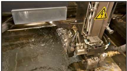
wire & spark erosion